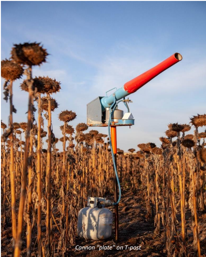
Cannon "plate" on T-post

Get propane cannons off the ground by securing them on top of chemical totes, metal or plastic drums, or cannon plate on T-posts. Make sure to secure cannon and tank.